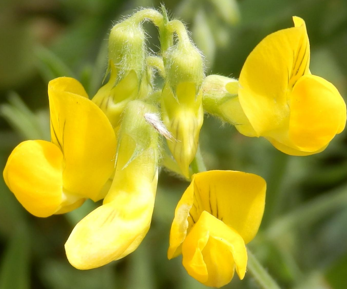
Meadow vetchling in Watery Lane