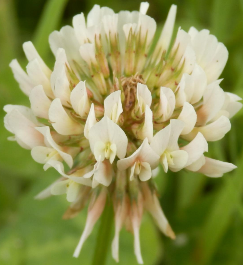
White clover in Bradley Lane