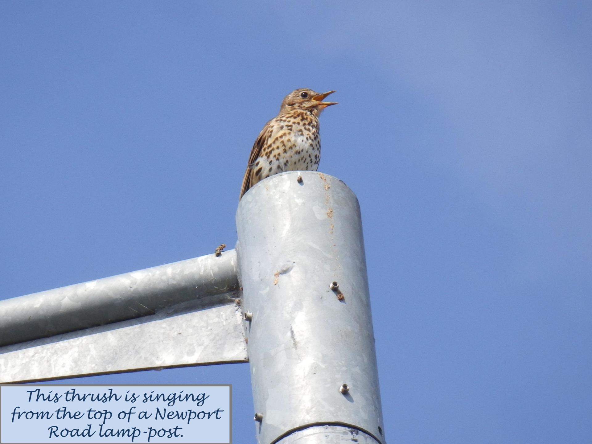
This thrush is singing from the top of a Newport Road lamp-post.