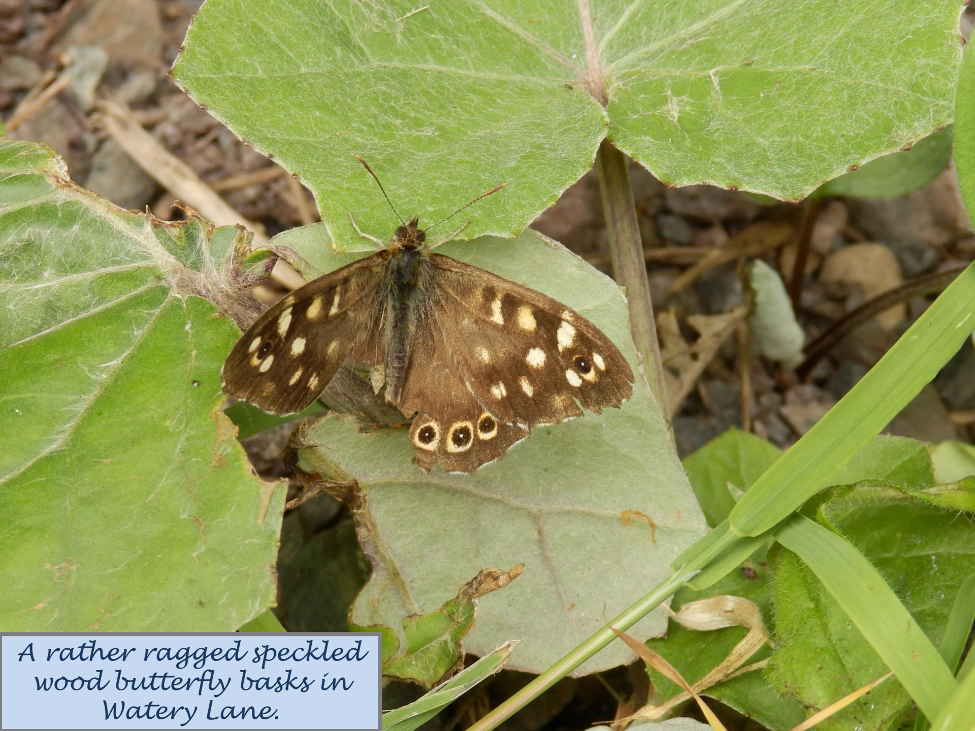
A rather ragged speckled wood butterfly basks in Watery Lane.