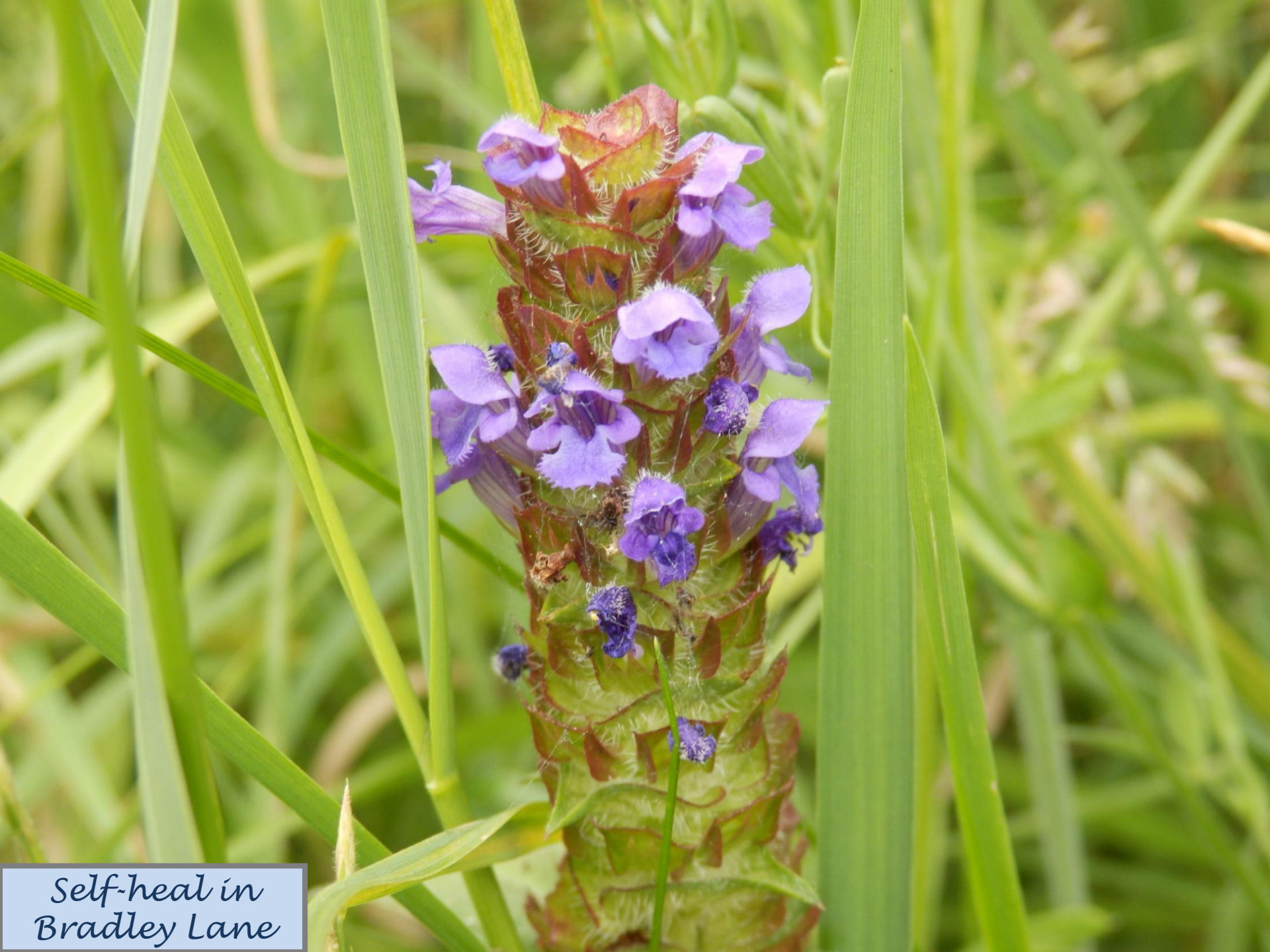
Self-heal in Bradley Lane