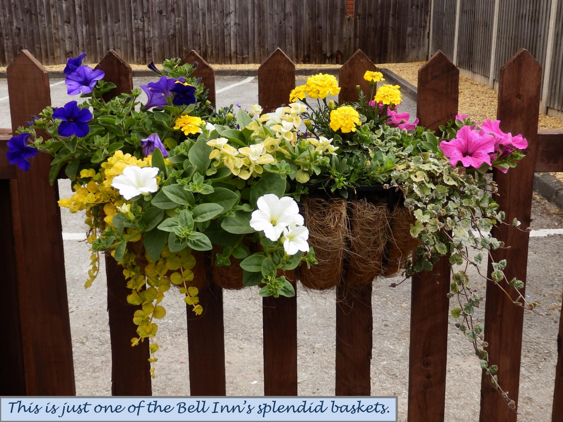
This is just one of the Bell Inn's splendid baskets.