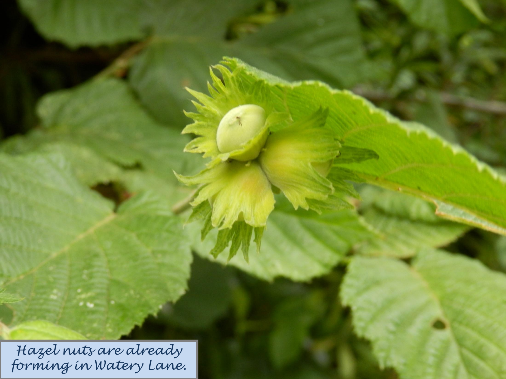
Hazel nuts are already forming in Watery Lane.