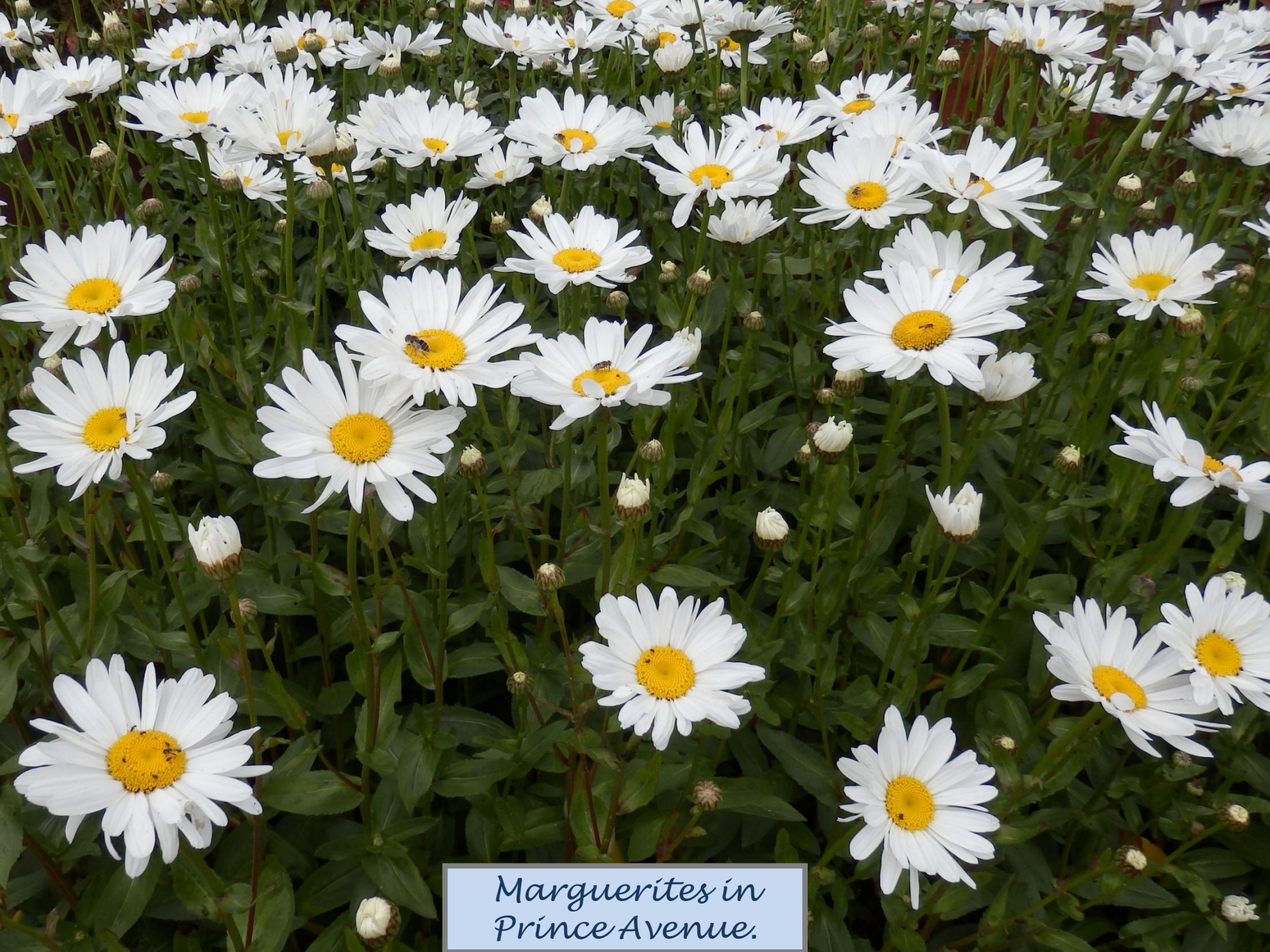
Marguerites in Prince Avenue.