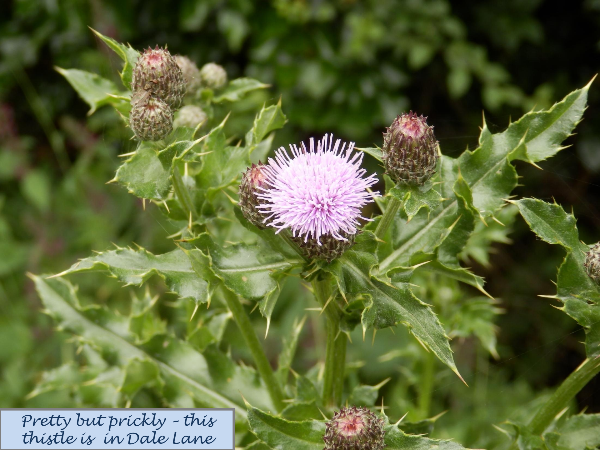
Pretty but prickly - this thistle is in Dale Lane