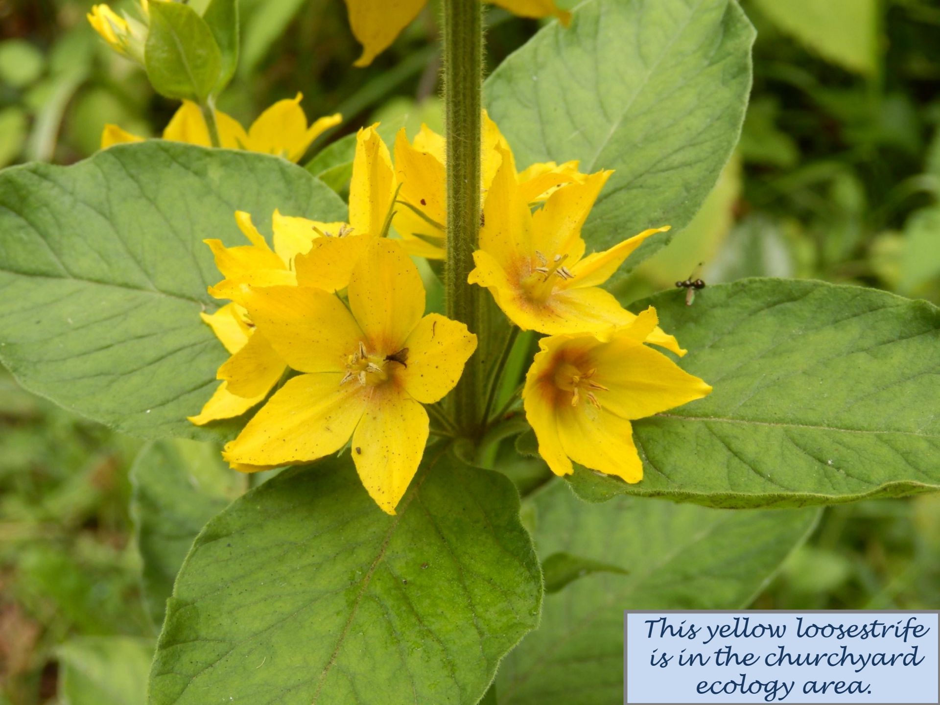
This yellow loosestrife is in the churchyard ecology area.