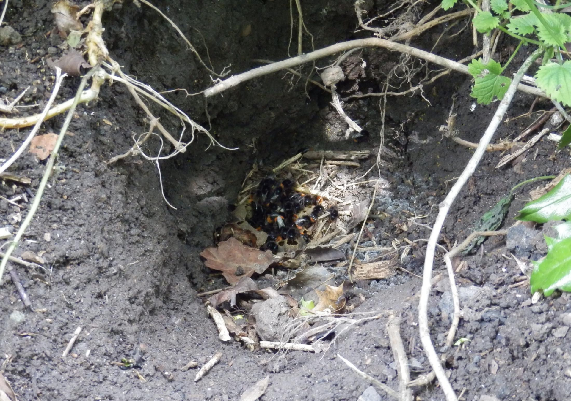
These bees have made a nest in a cow's hoof hole in Grassy Lane.