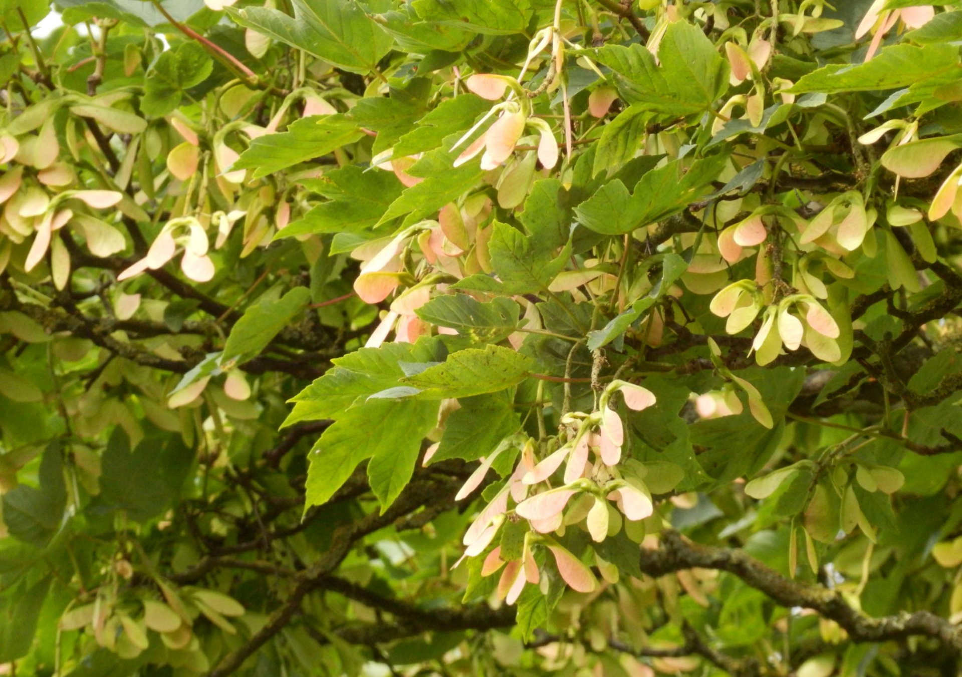
Orange-shaded sycamore keys in Back Lane.