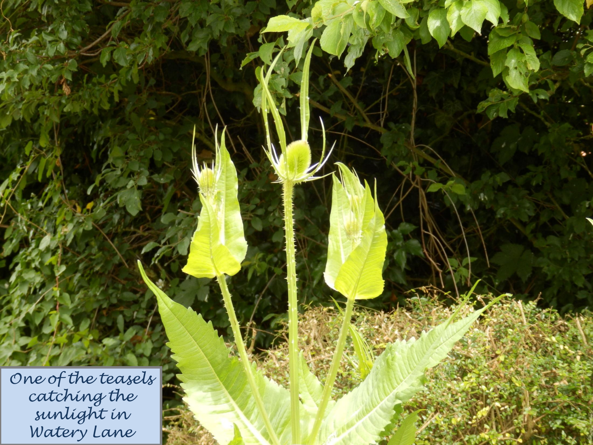
One of the teasels catching the sunlight in Watery Lane