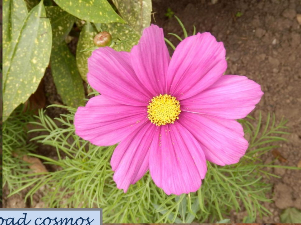
Newport Road cosmos