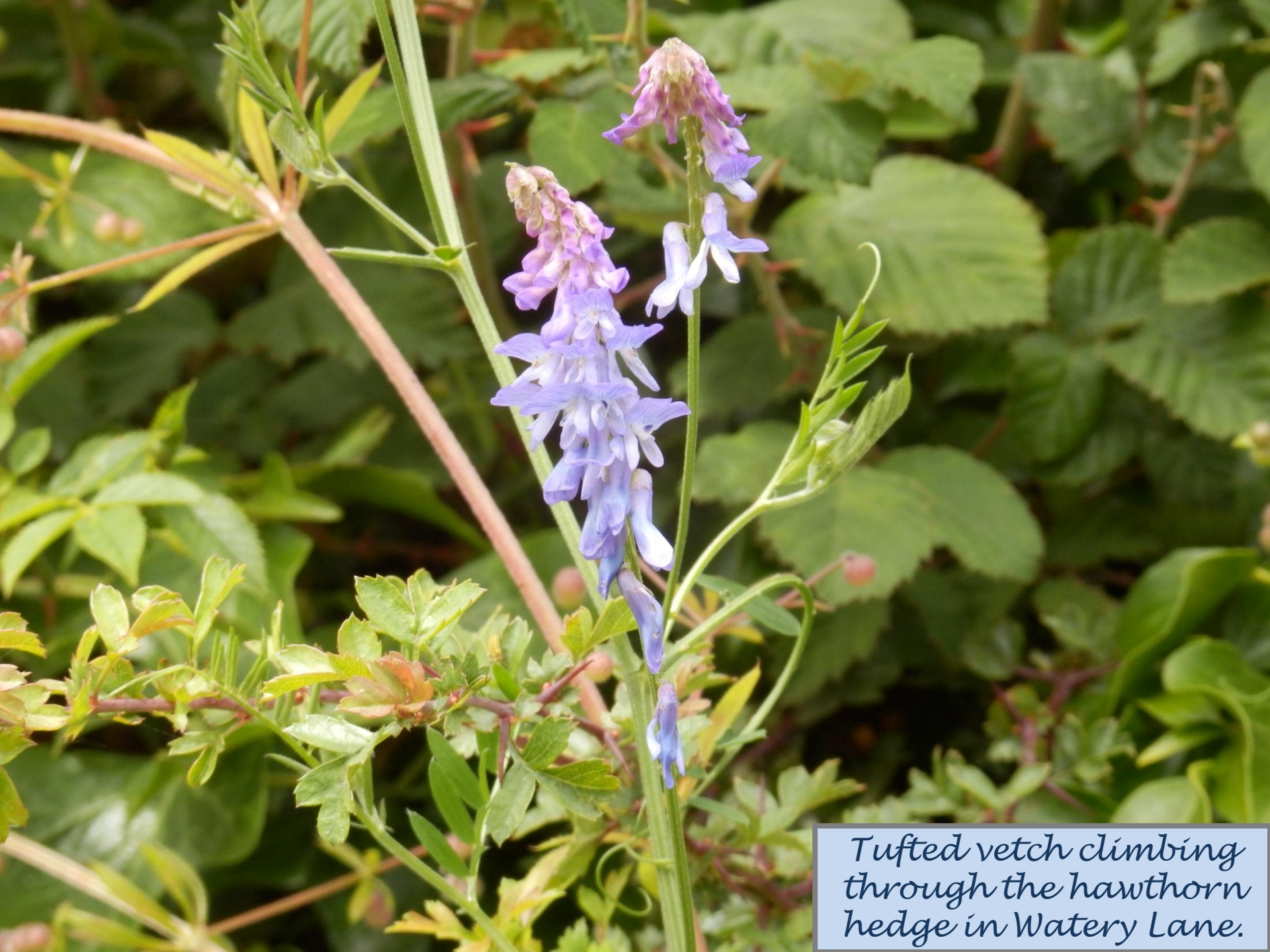
Tufted vetch climbing through the hawthorn hedge in Watery Lane.